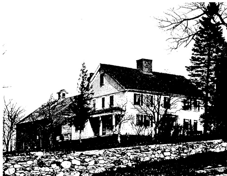
The Peter Rice Homestead, 377 Elm Street, Marlborough, is an Historical Museum listed on the National Register of Historic Places. This is how it appeared in the late 1800's.

Membership Meetings: (Open to the public, no charge.) 4th Tuesday of the month..... 7:30 p.m. (unless otherwise noted)